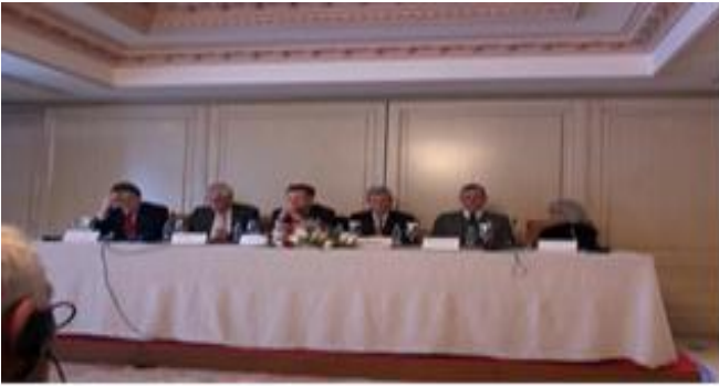
Final Conference: "Results and achievements of the Twinning Project- Future challenges of Environmental Protection in Kosovo*", with the presence of Mr. Shpetim Rudi – Deputy Minister of Environment and Spatial Planning, November 2013